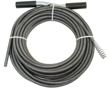
4400728 (728-T) 1/2" X 50ft SNAKE CABLE