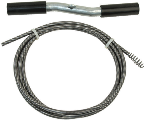
4400721 (721-T) 1/4" x 8ft SNAKE CABLE