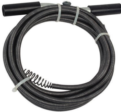
4400725 (725-T) 3/8" x 25ft SNAKE CABLE